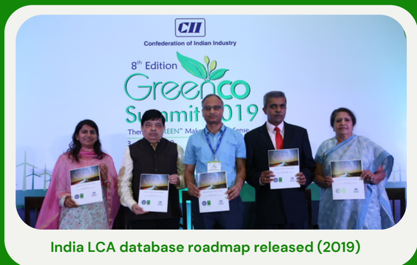
India LCA database roadmap released (2019)