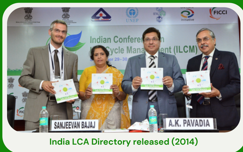
India LCA Directory released (2014)

In parallel, collaborative efforts by UNEP, NEERI, and CII culminated in the 2019 release of a roadmap for an Indian LCA database — a landmark step towards building the national data infrastructure that credible, India-specific life cycle work requires. Since then, the urgency has only grown: as global supply chains demand greater transparency and Environmental Product Declarations become increasingly standard in international trade, Indian industry faces both the challenge and the opportunity of embedding LCA into its sustainability practice. LCIS 2026 arrives at precisely this moment.