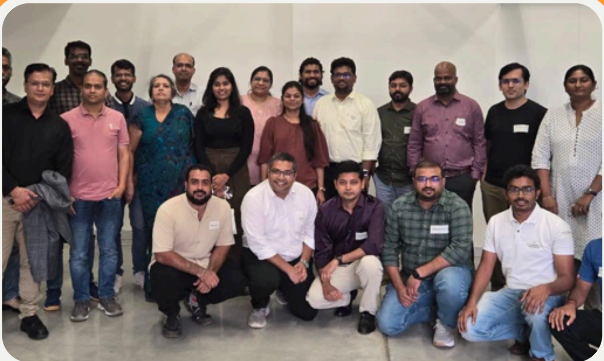
Barcamp participants at Bengaluru seminar

The seminar closed with an open, participant-led barcamp session — a format that surfaces genuine community priorities rather than predetermined agendas. The insights from that session were telling: Participants demonstrated not only a strong appetite for deeper engagement with LCA methodologies, but a clear and collective desire for a dedicated Indian platform to anchor this work going forward. LCIS 2026 is our direct response to that call — a conference designed by and for the Indian Life Cycle community, building on the momentum of Bengaluru and offering the scale, structure, and reach that the community has asked for.