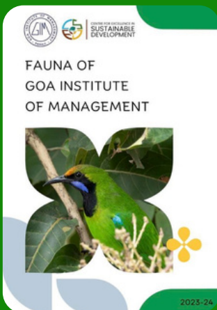
Biodiversity Awareness Programs

GIM offers not only a perfect venue for LCIS 2026, but also represents a leader in driving sustainability in India with a modern, environmentally conscious setting for academic exchange and collaboration. Through its Centre for Excellence in Sustainable Development (CESD), GIM is actively integrating sustainability into research, education, and practice. In order to integrate sustainability into practice, CESD has developed a sustainable events framework and an event carbon footprint calculator that measures greenhouse gas (GHG) emissions associated with campus events and institutional activities.