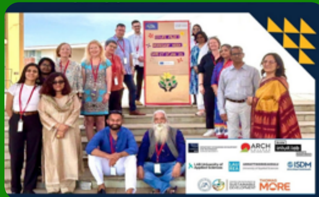
Co-LIFE Project (Erasmus+)